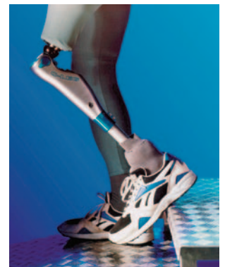
'Smart' knees like the C-Leg® help amputees with life's ups and downs.

In real time the decision-making chip signals the swing-phase control to react so the limb will be ready for heel strike at the appropriate instant and place. Then at heel strike, the microprocessor signals the knee to restrict flexion until late stance phase, providing needed stability for full weight-bearing, then gradually allows flexion in preparation for toe-off. Smart knees can further detect danger of falling or slipping and react to keep the knee from contributing to a fall.