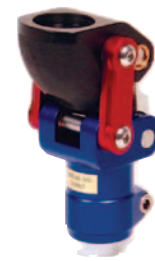
MightyMite® 4-bar knee for geriatric and pediatric patients